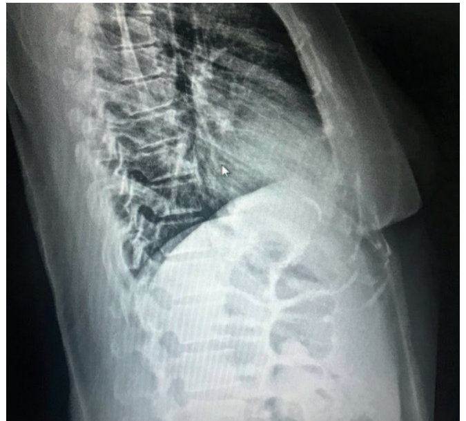
Figure 4 | Radiograph of the dorsal spine.

The patient was diagnosed with NP based on her suggestive description of pain and the accompanying signs on the physical examination.