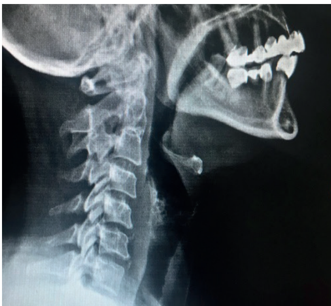
Figure 3 | Radiograph of the servical spine.

Radiograph of the spine showed cervical (Figure 3) and dorsal (Figure 4) degenerative changes. The patient's laboratory tests were normal.