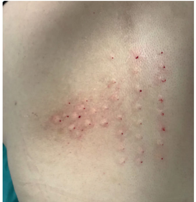
Figure 2 | The picture after treatment with T2-T10 local segmental and to the hyperpigmented area with 1% lidocaine .

We applied to this patient T2-T10 local segmental and to the hyperpigmented area with 1% lidocaine for treatment (Figure 2).